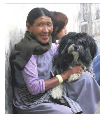
● Waiting to meet the vets