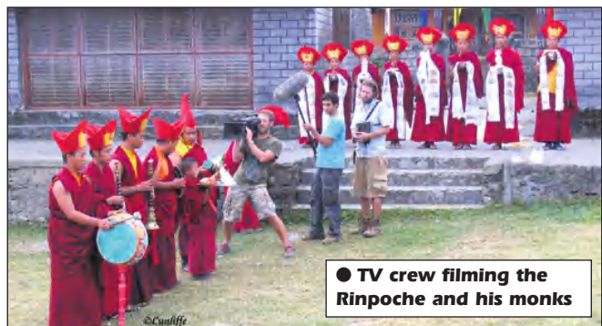
● TV crew filming the Rinpoche and his monks

the scarcity of snow leopards! Finally, anyone who would like to know more about HART and the work we do here should please take a look at our new web site, www.himalayananimalrescueteam.com Our old address is now being used by another charity; this is totally out of order and understandably causing great confusion amongst our supporters.