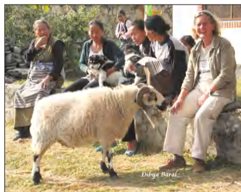
● A most glorious ram from Tibet seems anxious to join the queue