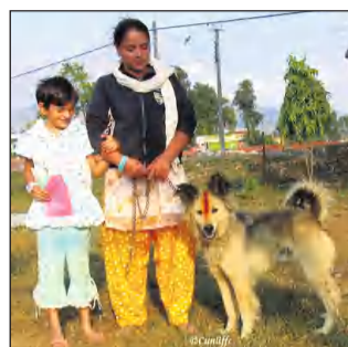
● Happy to go home after his rabies jab the owners daughter clutching HART's informative leaflet