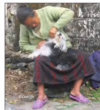
● Giving her Apsos the once over before her injections