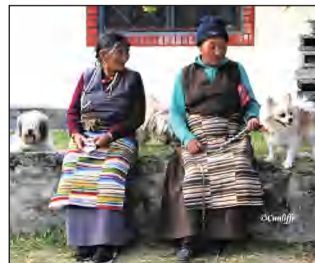
● Two Tibetan ladies with their Apsos