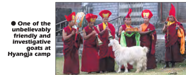
● One of the unbelievably friendly and investigative goats at Hyangja camp